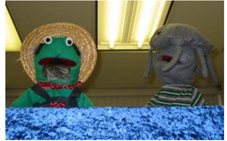
The puppets from Applebee Pond introduce the bullying program

The students of Northside Elementary, Hartman Elementary, Perry Elementary, and Walnut Ridge Elementary are taking a stand against bullying and making their schools a Bully-Free Zone!