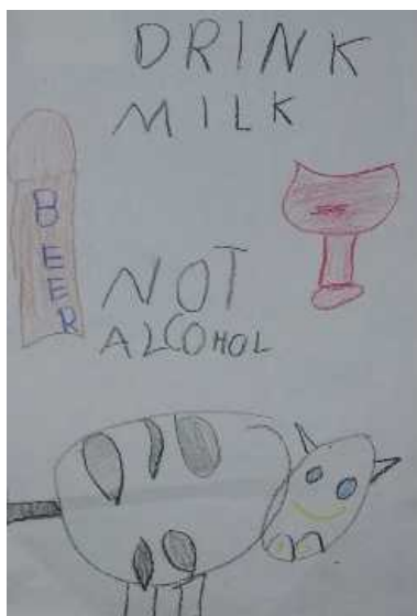
D'Asia Francis Kindergarten New Castle